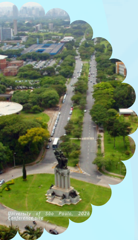
University of São Paulo, 2026 Conference site