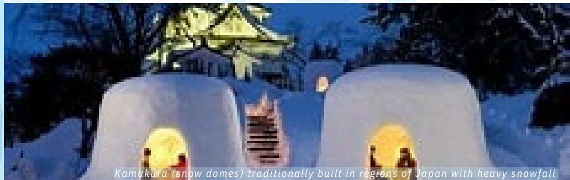
Kamakura (snow domes) traditionally built in regions of Japan with heavy snowfall

Scan the QR code to join the NextGen WhatsApp group chat